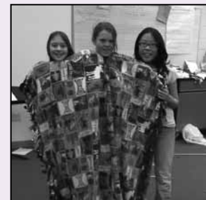
Tri-M students show off a blanket they made.

As chapter advisor I researched to find an organization that would accept our blankets. Project Blankets for Haiti stood out amongst the others. Contact was made and the blankets were constructed. Several students donated fleece, and the blankets were created after school at a Tri-M meeting. I have never seen a group of 25 middle school students come together as they did. Boys and girls sat around and made blankets. They were so proud of what they had accomplished. They still talk about it six months later. They know they made a difference in the lives of others. We are looking forward to another great year at our school.