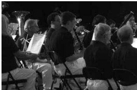
Tri-M members playing in the band.

If a high school Tri-M musician watched this band after only playing in a high school band, he/she would notice two differences. First, everyone practiced and truly cared about the quality of the performance. Second, the band members helped teach each other the smallest details regarding dynamics, articulation, and other aspects of music rather than one music teacher trying to deal with the whole band. All of the Tri-M players benefited immensely from joining the Community Band and hope to pursue further challenges in the field of music.