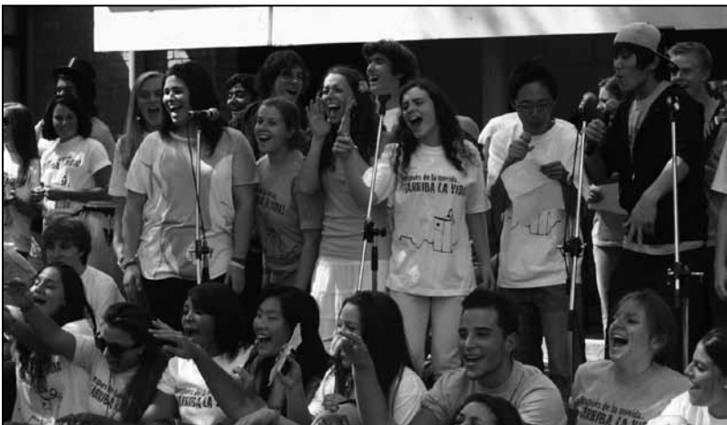
Tri-M students sing "We Are the World."

Our original plan was a fundraising project for Haiti's earthquake victims. However, after Chile was rocked by an earthquake in the early morning hours of February 27, the plan abruptly changed course. Despite aftershocks and classroom evacuations, Tri-M members teamed up with the Student Council and National Honor Society to throw an outrageous fundraising festival. After a week of collecting clothing, tents, sleeping bags, and food, the school com-