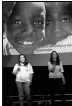
Tri-M members promoting Project Gazelle.

Last year our chapter participated in Project Gazelle. We sold handmade bracelets to raise money to sponsor Kenyan orphans. We raised over $500 by selling jewelry and other handmade merchandise at our Spring Variety Show. We also ran a booth selling bracelets during lunch for 2-3 weeks. Our group was very successful in selling these bracelets, and we were very happy to raise money for the children in Kenya.