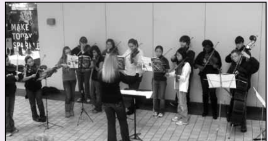
Tri-M members of Lakewood Middle School.

Chapter of the Year winners and runners-up receive scholarship funds for summer music study. For more information on Chapter of the Year, visit www.menc.org and search, "Tri-M Chapter of the Year." Want to be the 2011 Chapter of the Year? Submit your chapter's entry by April 23, 2011. See website for new electronic submission process.