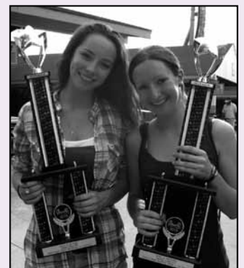
Tri-M members hold 1st place awards in May 2010.

When the performances were over, they boarded the bus for Dorney Park—a popular Pennsylvania amusement park. There, they relaxed and enjoyed a sunny day in the park with only the anticipation of the Awards Program remaining. A sweet end to a busy day, the groups were awarded 1st place in each of their respective categories: High School String Orchestra and High School Women's Choir. Success on the stage just after learning of their Tri-M award was a perfect end to a busy year.