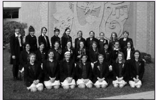
Tri-M members of Villa Maria.