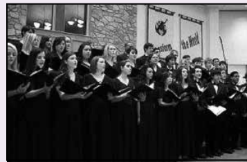
The choir at the concert.

has always been associated with bringing people together, and this event is no exception.