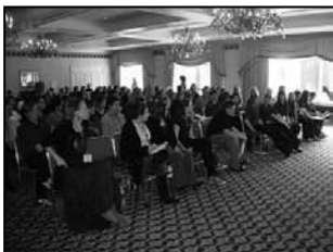
Tri-M students listen intently.