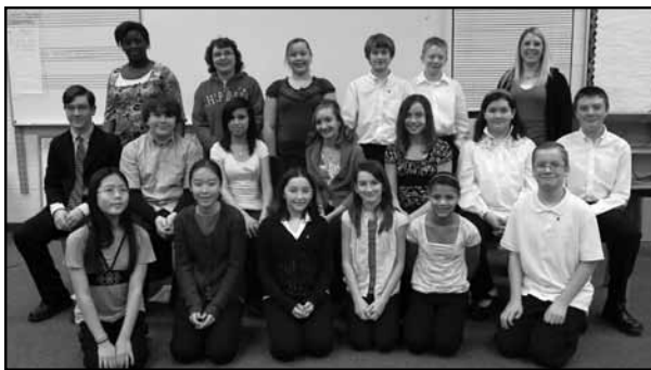
Tri-M members of Lakewood Middle School.

We also attended our state conference (KMEA) this year. We attended all of the Tri-M student sessions, as well as the exhibits and some teacher's sessions, and saw several great performing groups throughout the day.