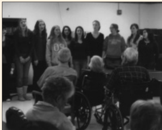
Tri-M members singing at a nursing home this past winter.

HHS Tri-M members will also be participating in Relay for Life this May to support cancer research. HHS Tri-M has participated in this event for the past three years and will continue to support this great cause in years to come.