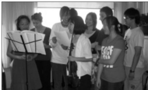
Unionville High School Tri-M members performing “The Sound of Music.”

During one of our monthly visits to a local senior residence, Tri-M members got the chance to socialize with the residents. With our desire to entertain our senior audience, Tri-M members asked for requests on what our audience would like our members to perform. The senior residents were enthusiastic as many suggested selections from “The Sound of Music.” Our Tri-M chapter arranged and rehearsed various songs from “The Sound of Music” and proudly presented our version to two local senior homes during the month of June. This worthwhile experience gave much satisfaction from knowing that our Tri-M chapter had brought a little something dear to our local senior residents.