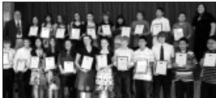
First members of the newly chartered Tri-M Society.

The Crain Middle School Band chartered the Tri-M Music Honor Society in Decem-