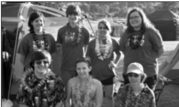
The "set-up crew".

On May 29 and 30, 2009, United High Schools' Tri-M Chapter 3405 sponsored a team in the local "Relay for Life Rally." The theme for this 24-hour Relay was "Wave Goodbye to Cancer." The team consisted of 18 Tri-M members. Each participant took a shift walking the 1/3 mile track at the recreational complex, in Indiana, PA. Our team raised close to $1,000 through family donations, school staff donations, and our newest hit fundraiser, which allowed students to purchase songs to be played during lunch periods and morning announcements. Even though this was United Tri-M's first Relay, there is no doubt that we will continue to make this an annual effort. The Relay comes with lots of fun activities for the walkers, including volleyball, ice cream eating contest, pajama contest, etc. We definitely had the most musical tent!