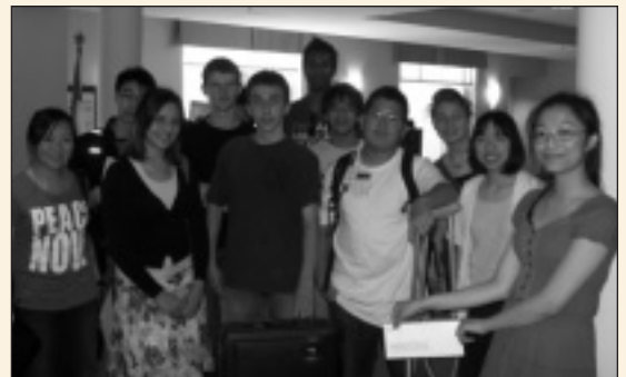
Tri-M members present donation to Unionville Home Society.

Aside from performing at local seniors' residences, our Tri-M chapter wanted to further contribute to our community. At one of our performances, our members noticed a posted message for donations. This inspired our chapter fundraiser. Handmade music items were designed and created by our "factory" and sold in our school's music department. All our proceeds were donated to the Unionville Home Society in hopes of helping our local senior residence. This fun fundraiser not only provided an opportunity to contribute to our community, but also strengthened the friendships within our Tri-M chapter.