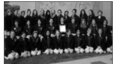
Tri-M members of Villa Maria Academy.

This very active chapter attends plays and musicals throughout the year; participates in orchestra, band and choral performances; writes welcome