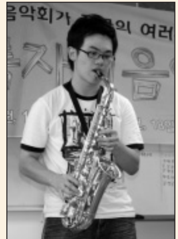
Tri-M President playing saxophone

The 3rd Triple-C CheongShim Charity Concert was a student-organized concert where all the proceeds went to charity. In contrast to the 1st and 2nd Triple-C concert, the 3rd Triple-C made a nationwide tour. From August 14 to 18, 2009, Tri-M Society members of CheongShim International Academy visited 5 different provinces to entertain