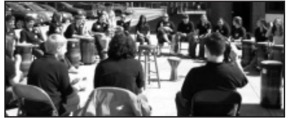
Students participating in World Drumming.

To end the musical day, students and teachers made rhythms in an outdoor World Drumming Practicum. In this fun activity, participants played a variety of instruments, such as drums and maracas, while making friends and playing games. These events made for an outstanding and successful day. Shenendehowa plans to continue offering its Tri-M Music Conference annually.