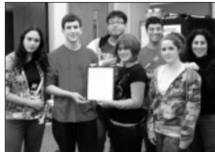
Members of the new Tri-M Society at Jenkintown HS.

a concert at the Wyncote Church Home on St. Patrick's Day. The residents really enjoyed the program, especially the Irish song sing-a-long!