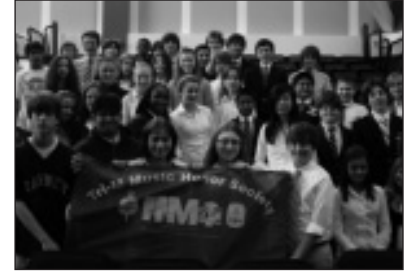
Tri-M members of Ranney MS.

One of the highlights of the year for Ranney Middle School was their "Toys for Tots" drive. After raising $500 through fund-raising efforts. Tri-M