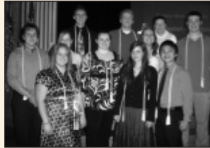
Tri-M seniors recognized for graduating with Honors

Already we've had multiple service and volunteer projects.