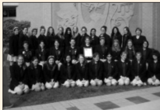
Tri-M members of Villa Maria pose for the camera.