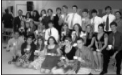
Members of the Tri-M Society at The King's Academy.