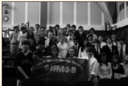
Tri-M members of Ranney MS.

Chapter of the Year winners and runners-up receive scholarship funds for summer music study. For more information on Chapter of the Year, visit www.menc.org and search, "Tri-M Chapter of the Year". Want to be the 2009–2010 Chapter of the Year? Submit your chapter scrapbook by April 30, 2010.