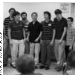
Plainview-Old Bethpage Tri-M members from nine music ensembles (including the a capella group pictured above) perform for the elderly.

Our chapter presented a program of holiday vocal and instrumental music at the nursing home, and we adopted a student to make sure she would have a happy holiday.