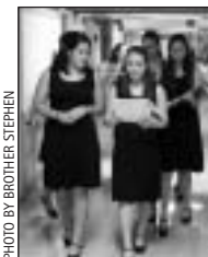
St. Brendan's Sabre Singers caroled at the Villa Maria Nursing Center this Christmas.