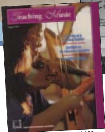
COVER OF THE FIRST ISSUE OF TEACHING MUSIC, AUGUST 1993

Congratulatory letters to MENC from President George W. Bush and others; some letters edited for length.