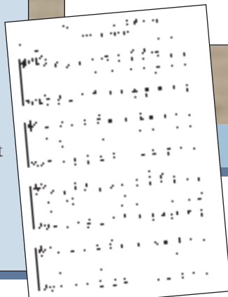
EXCERPT FROM THE SERVICE VERSION OF "THE STAR-SPANGLED BANNER," 1918