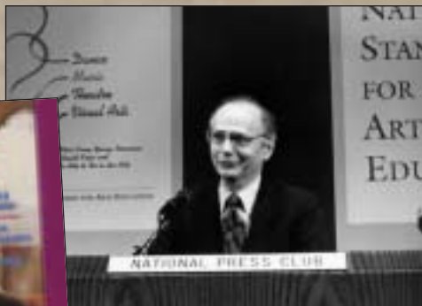
SECRETARY OF EDUCATION RICHARD RILEY ACCEPTS THE NATIONAL STANDARDS FOR ARTS EDUCATION, MARCH 11, 1994.

1993 Publishes the first issue of Teaching Music .