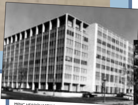
MENC HEADQUARTERS IN WASHINGTON DC IN 1956