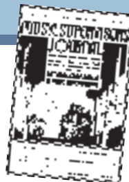
FRONT PAGE OF AN EARLY MSJ, SEPTEMBER 1916

Adopts a constitution and the name Music Supervisors National Conference.