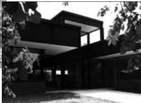
FIRST MENC HEADQUARTERS BUILDING IN RESTON, VIRGINIA, 1975

Moves headquarters to National Education Association Building in Washington DC, 1956.