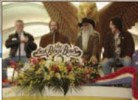
THE OAK RIDGE BOYS ON THE TOURNAMENT OF ROSES PARADE FLOAT SPONSORED BY NAMM AND FEATURING THE NATIONAL ANTHEM PROJECT, JANUARY 1, 2007

1994 Introduces the National Standards for Arts Education.